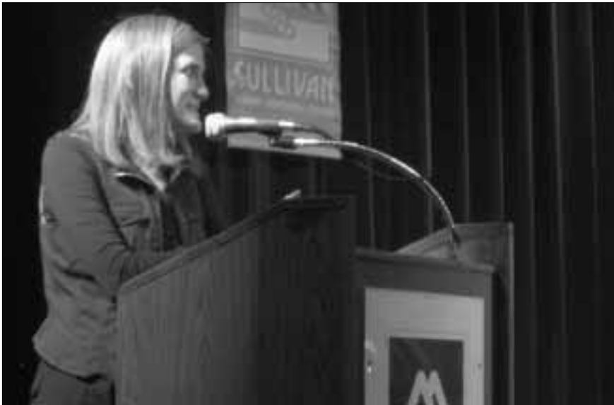
Amy Goodman, host of Democracy Now , addresses a packed-house in Sullivan County Community College's Seelig Theatre on October 26th when she made a stop on her book tour. The event was sponsored by WJFF, Sullivan County Community College, and Hamish & Henry Booksellers.